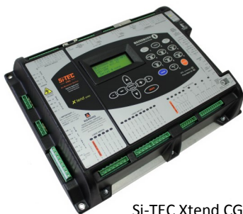
Si-TEC Xtend CGC-T